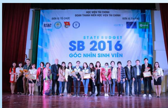
Photo: The organization boards and finalist teams in the final round of SB 2016

After some challenges in determining the contest's theme and form, organizers successfully completed the project and gathered much useful experience in organizing activities for young people. It is hoped that, with these initial successes, BTAP will continue to be successful in its activities on the topic of state budget for the youth.